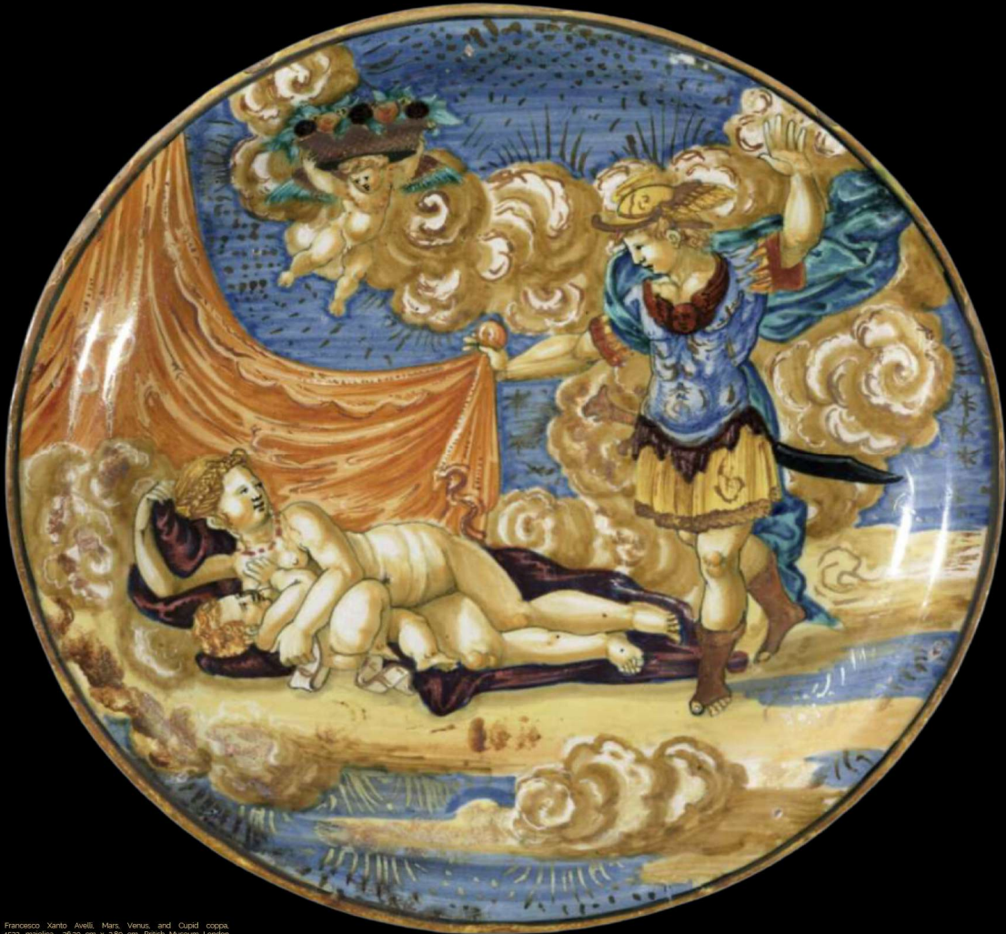
Francesco Xanto Avelli, Mars, Venus, and Cupid, c.1532, maiolica, 20.20 cm x 3.80 cm, British Museum, London

Love, Marriage, Desire. The civic and juridic status of women from antiquity to modernity: acquiescence, resistance, destabilization